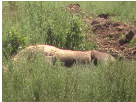
Dead horse at Frontier Meats