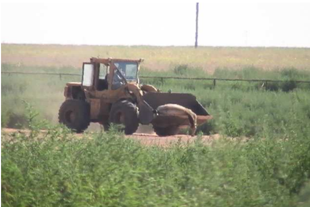
Dead horse on backhoe

We observed two men on a backhoe transporting a dead horse towards the southwest side of the property, where they off-loaded it in the composting area. We found several horse carcasses, and multiple horse parts in the field. Some of the carcasses had not been covered with composting material. As we stepped out of the car onto CR 197 we noticed a decomposing foal at our feet. Coyotes were observed eating the flesh of the deceased horses.