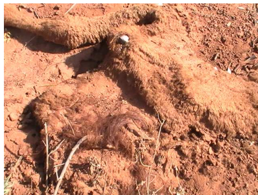
Dead foal outside of fence at southwest corner