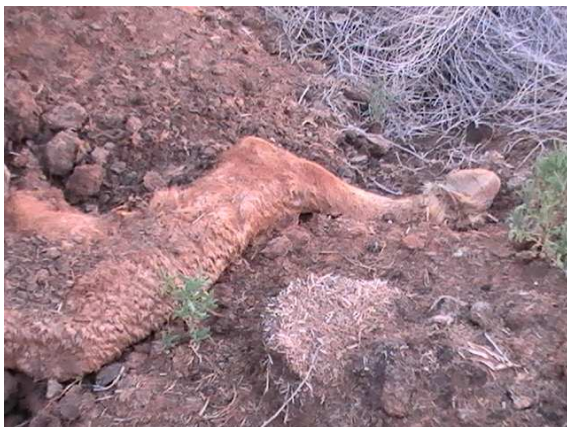
Decomposing foal leg